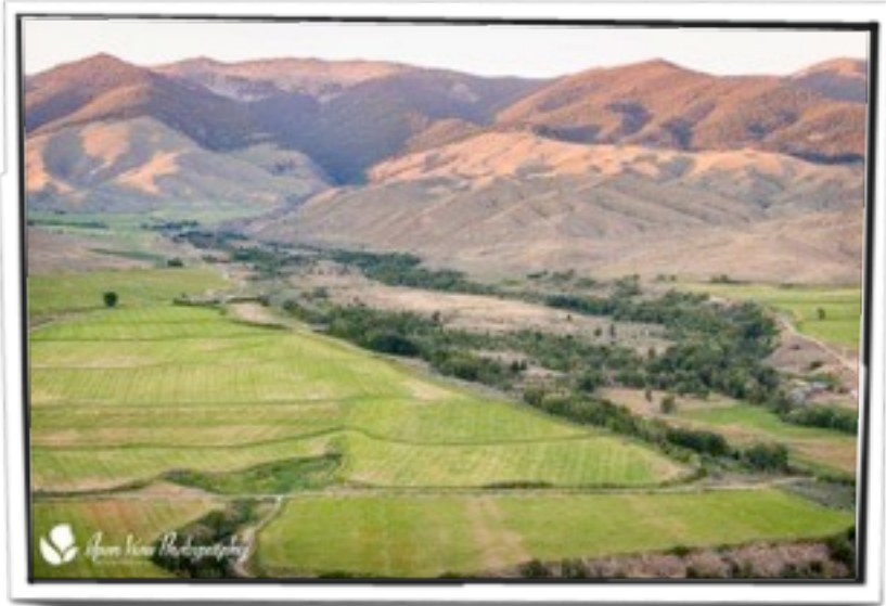
Bohannon Creek today is a classically pastoral scene.