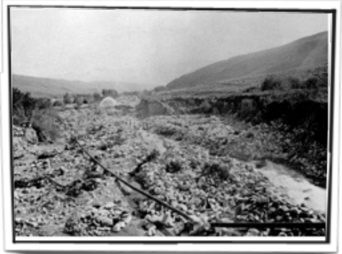
Bohannon Creek of the past had a more industrial flair.

Lemhi Regional Land Trust Salmon Valley Stewardship 107 South Center Street Salmon, ID 83467