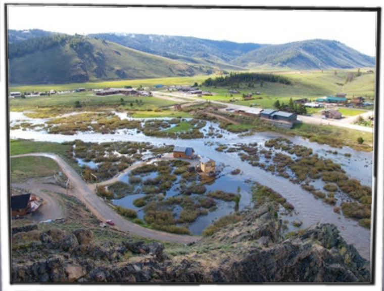
Gary Gadwa of Stanley shot this photo of Valley Creek escaping its banks last spring.

LRLT and SVS are proud to be co-sponsoring this workshop with Idaho Dept. of Fish and Game, Upper Salmon Basin Watershed Project, Salmon Chapter of Outfitters and Guides, and The Nature Conservancy.